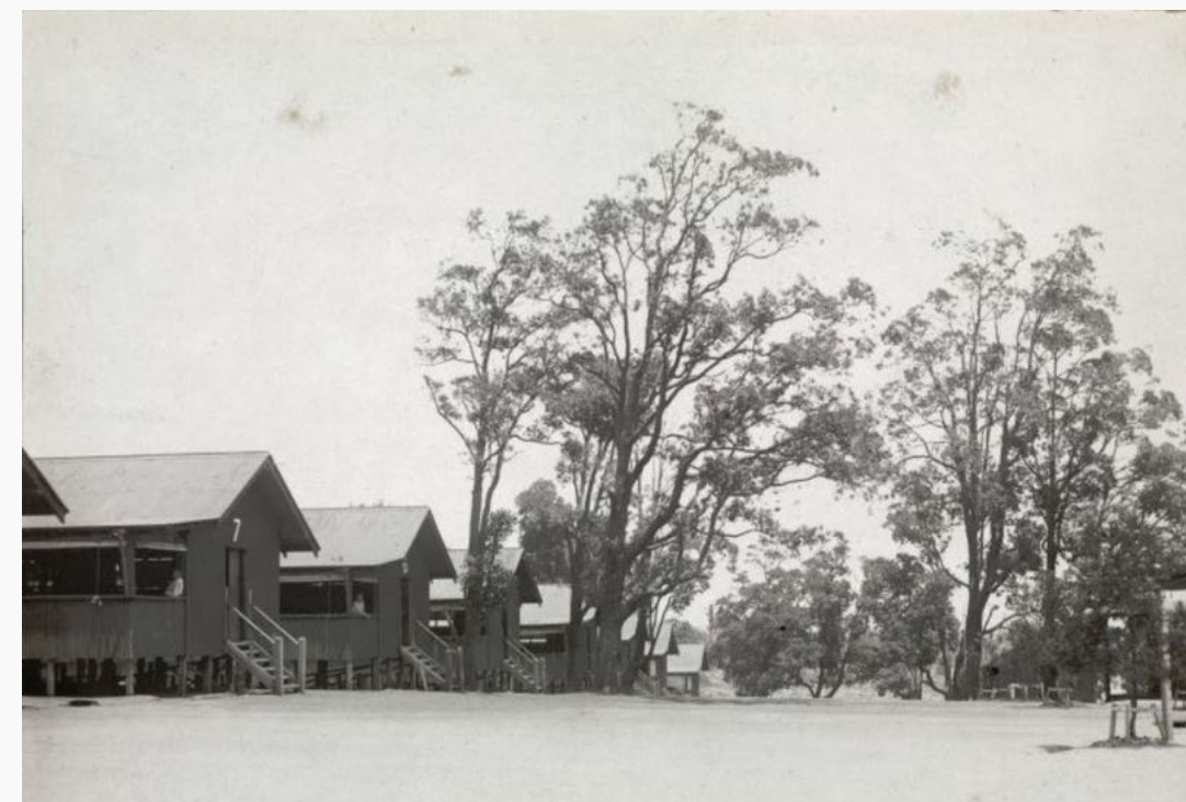
Section of the huts at Blackboy Hill SLWA photo b3600172_1